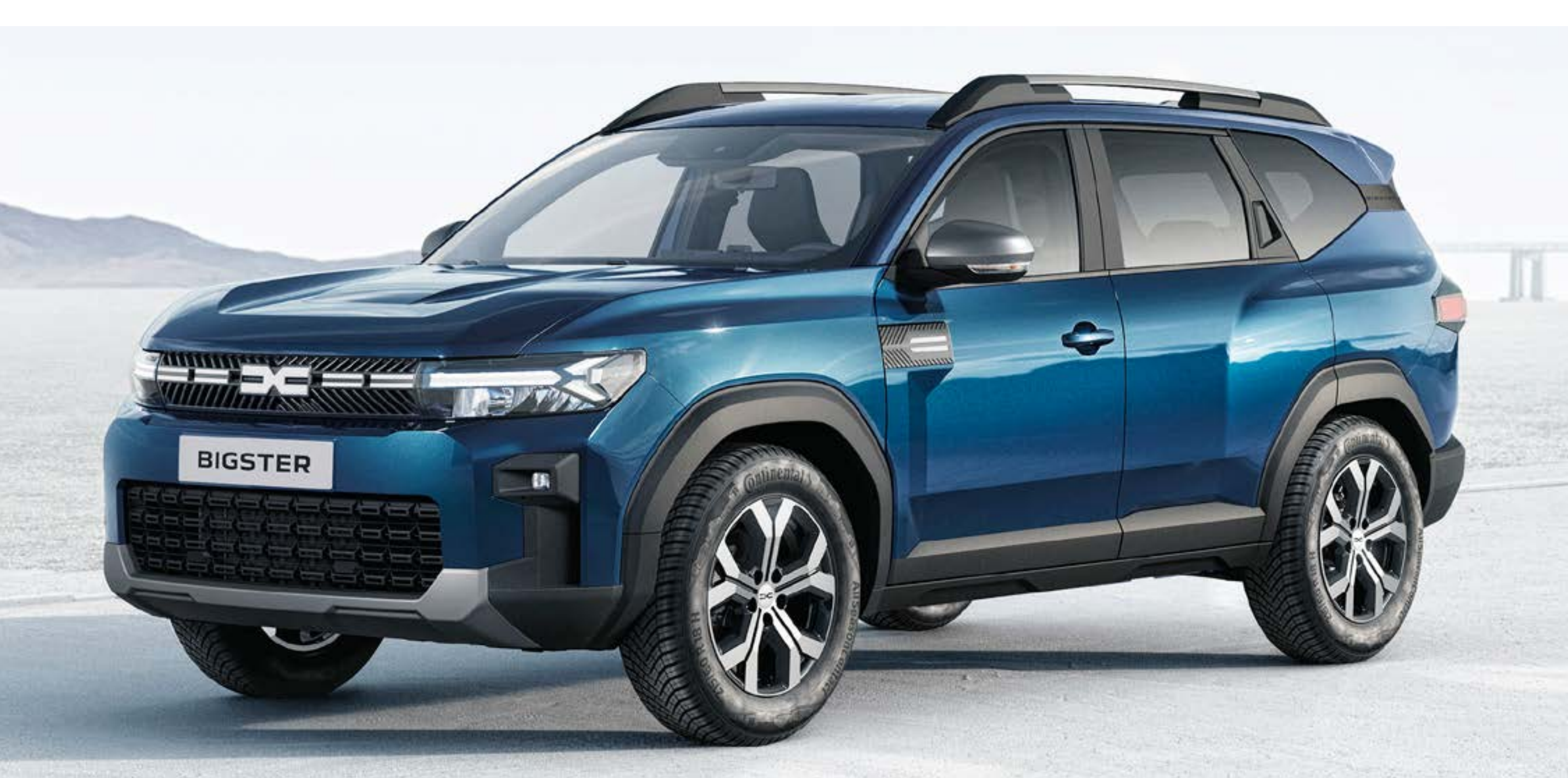
INDIGO BLUE (2)(3)