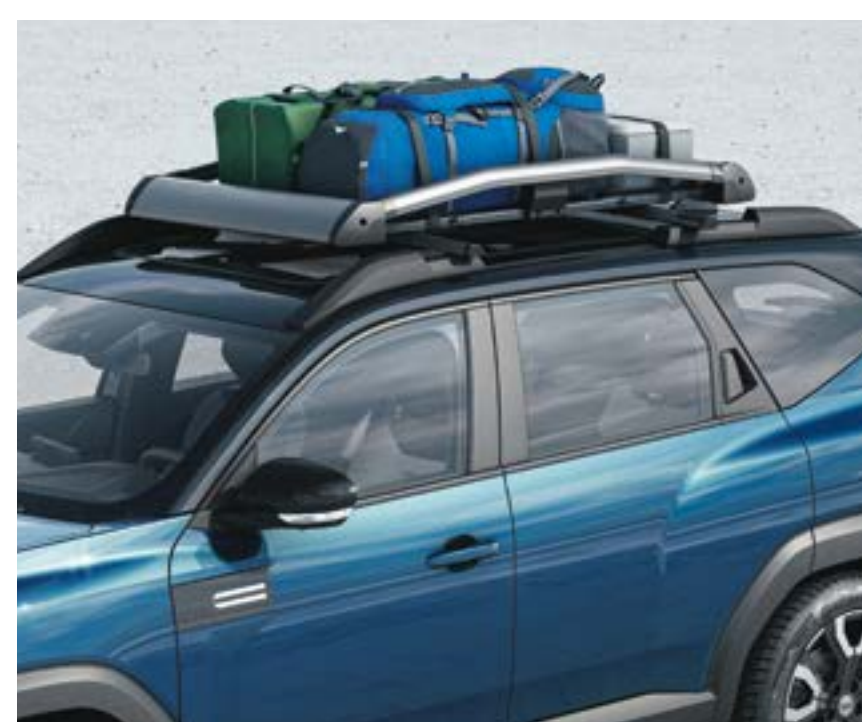
Cargo roof rack