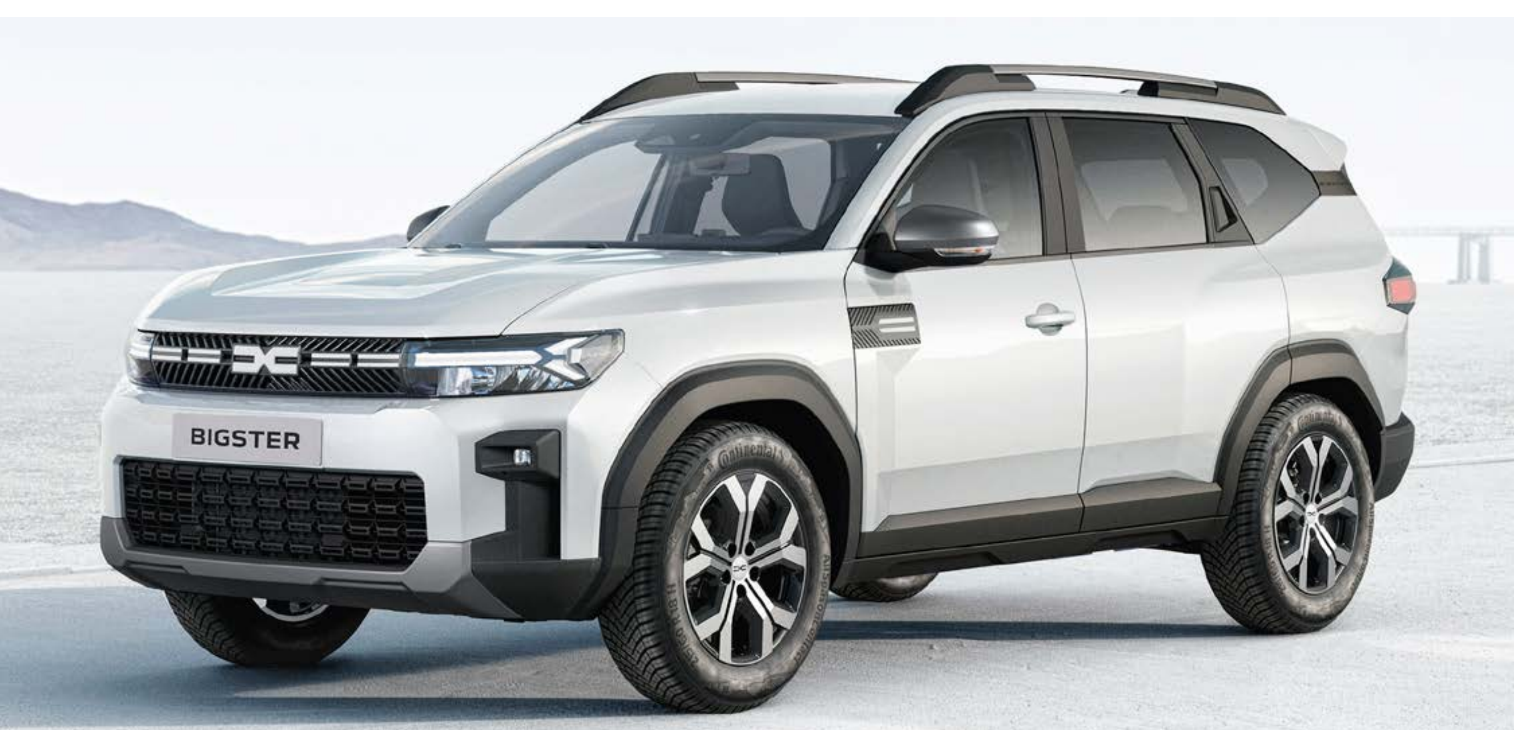
GLACIER WHITE (1)