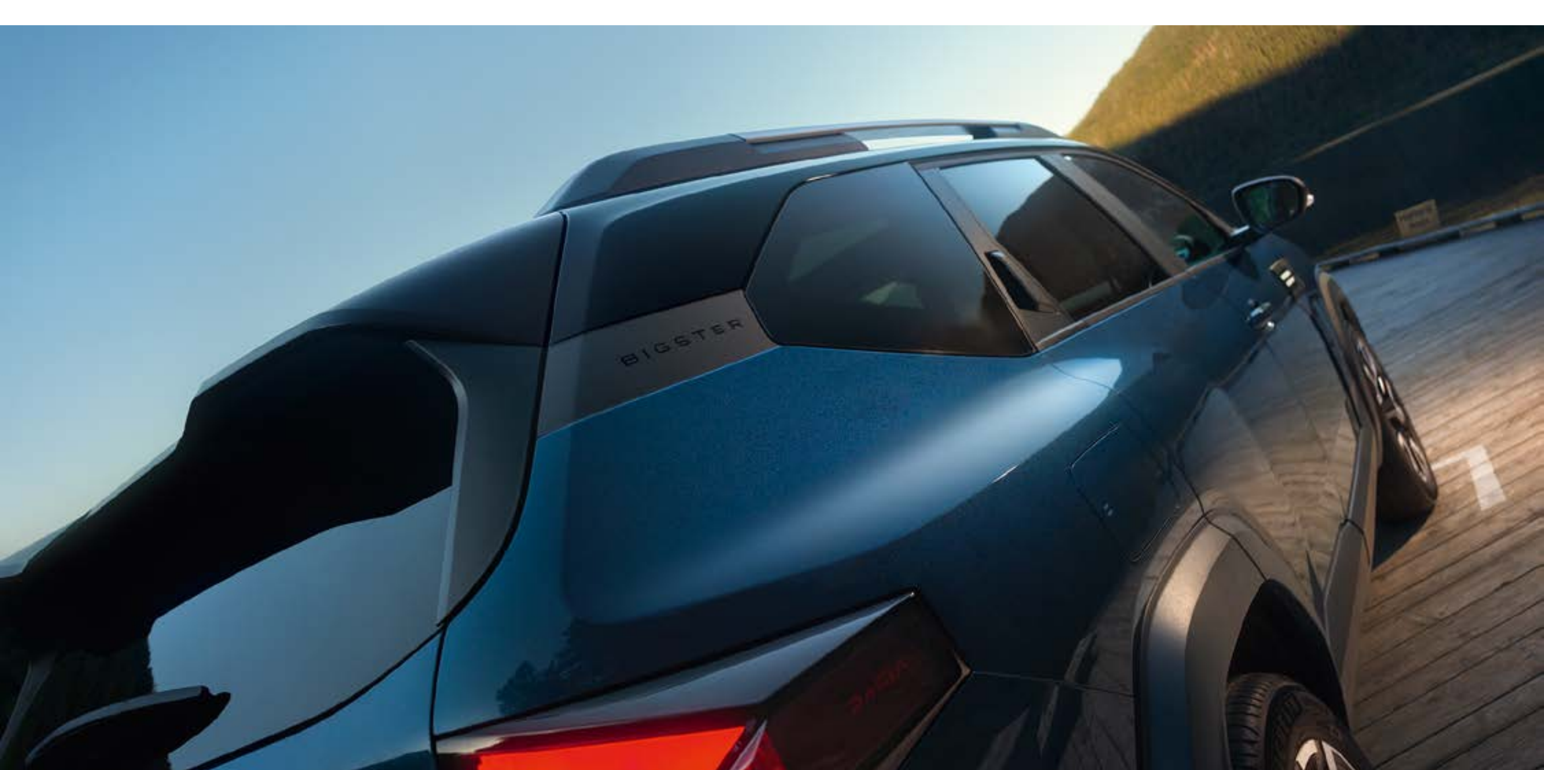
Exclusive two-tone colour (3)