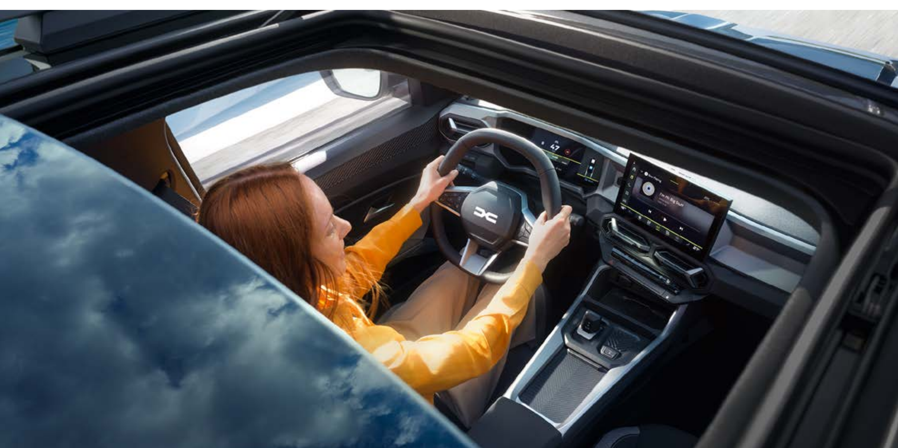
Panoramic opening sunroof (2)

Featuring a panoramic opening sunroof (1) providing unique interior light, its exclusive Indigo Blue exterior colour adds an additional touch of distinction. There's a Bigster for everyone.