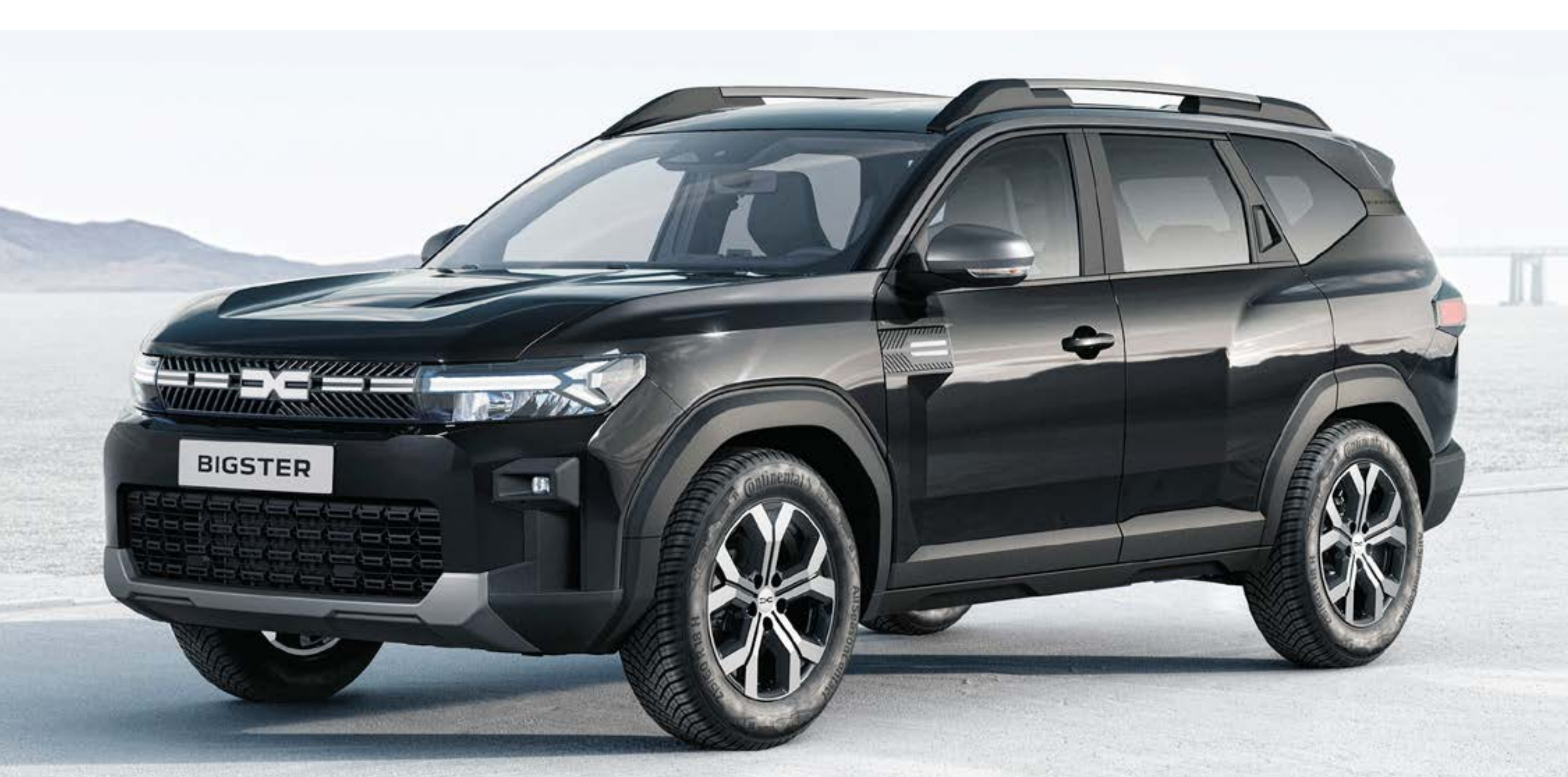
PEARL BLACK (2)